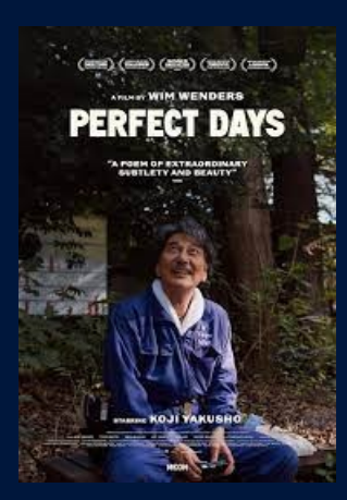
October 7th at 6:30pm