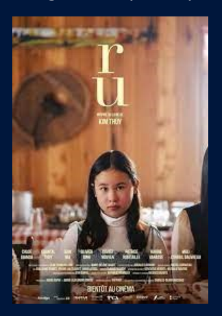
November 4th at 6:30pm