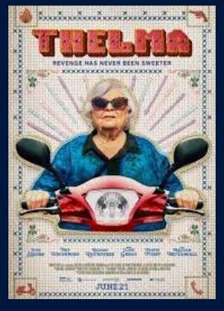
September 9th at 6:30pm

Enjoy critically acclaimed films at the library on the first Monday of each month at 6:30 p.m. The popcorn will be on and our concession will be open for your snacking needs. Admission is free but donations are gratefully accepted.